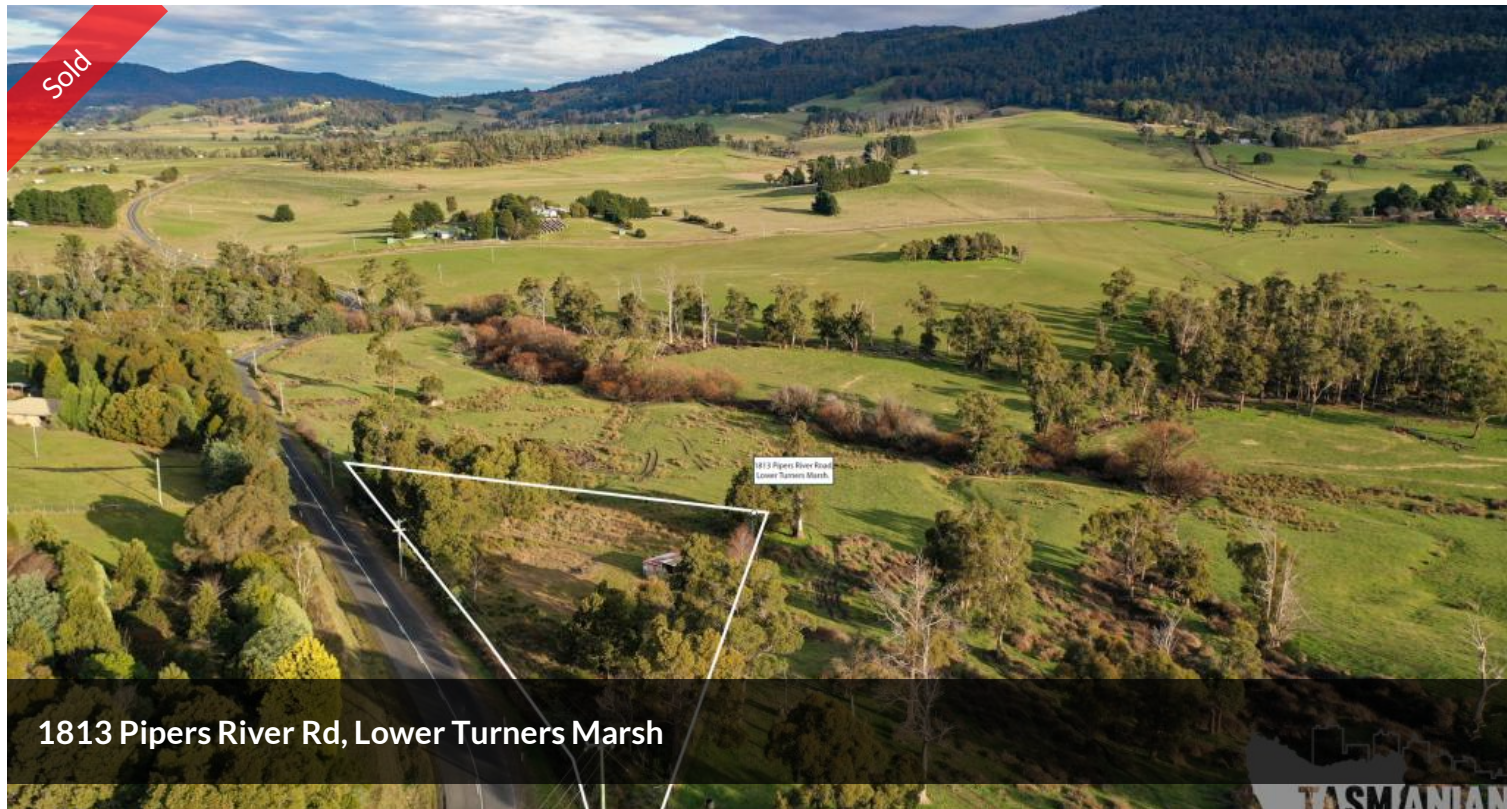
1813 Pipers River Rd, Lower Turners Marsh