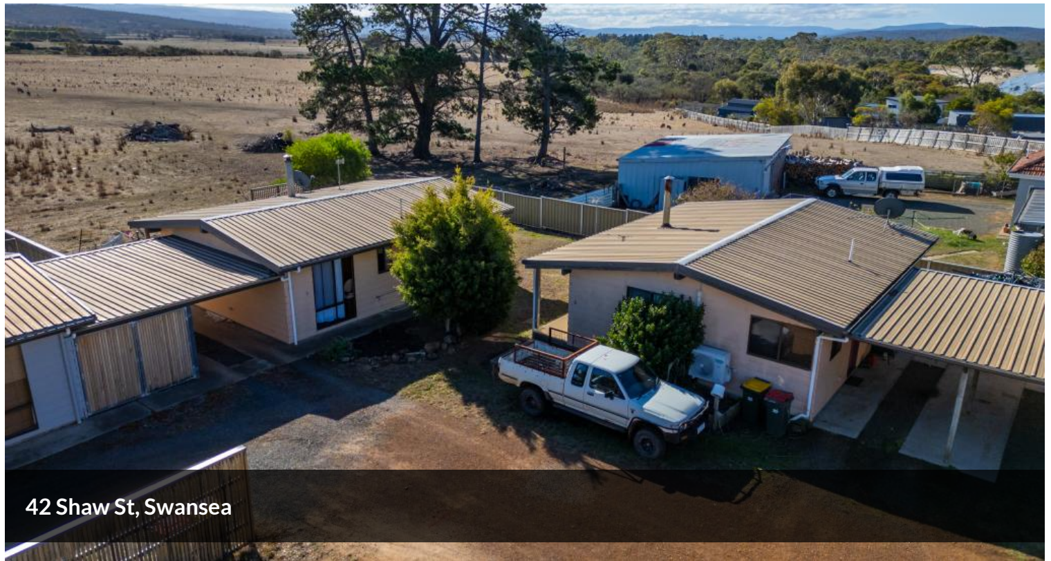
42 Shaw St, Swansea