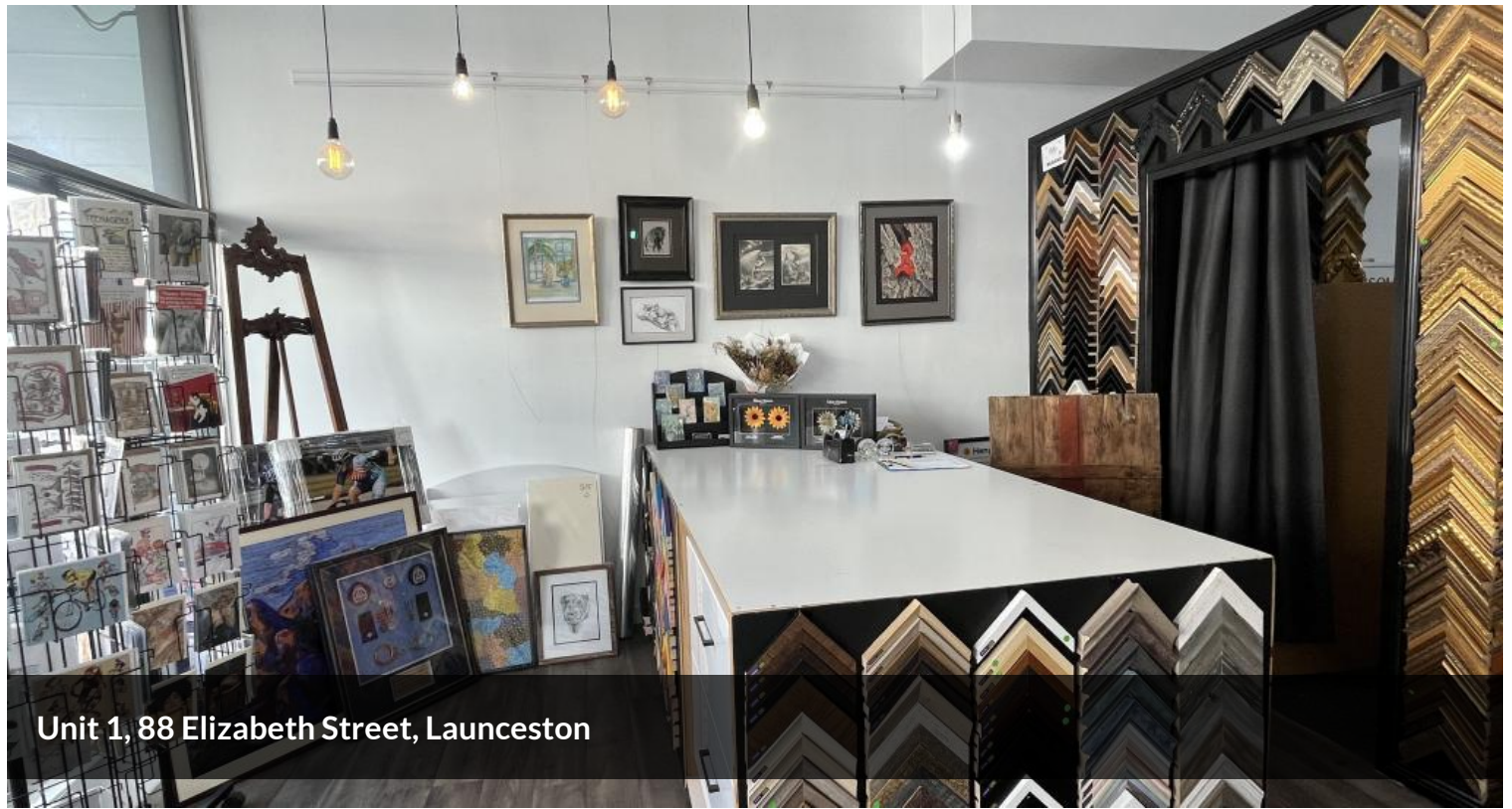
Unit 1, 88 Elizabeth Street, Launceston