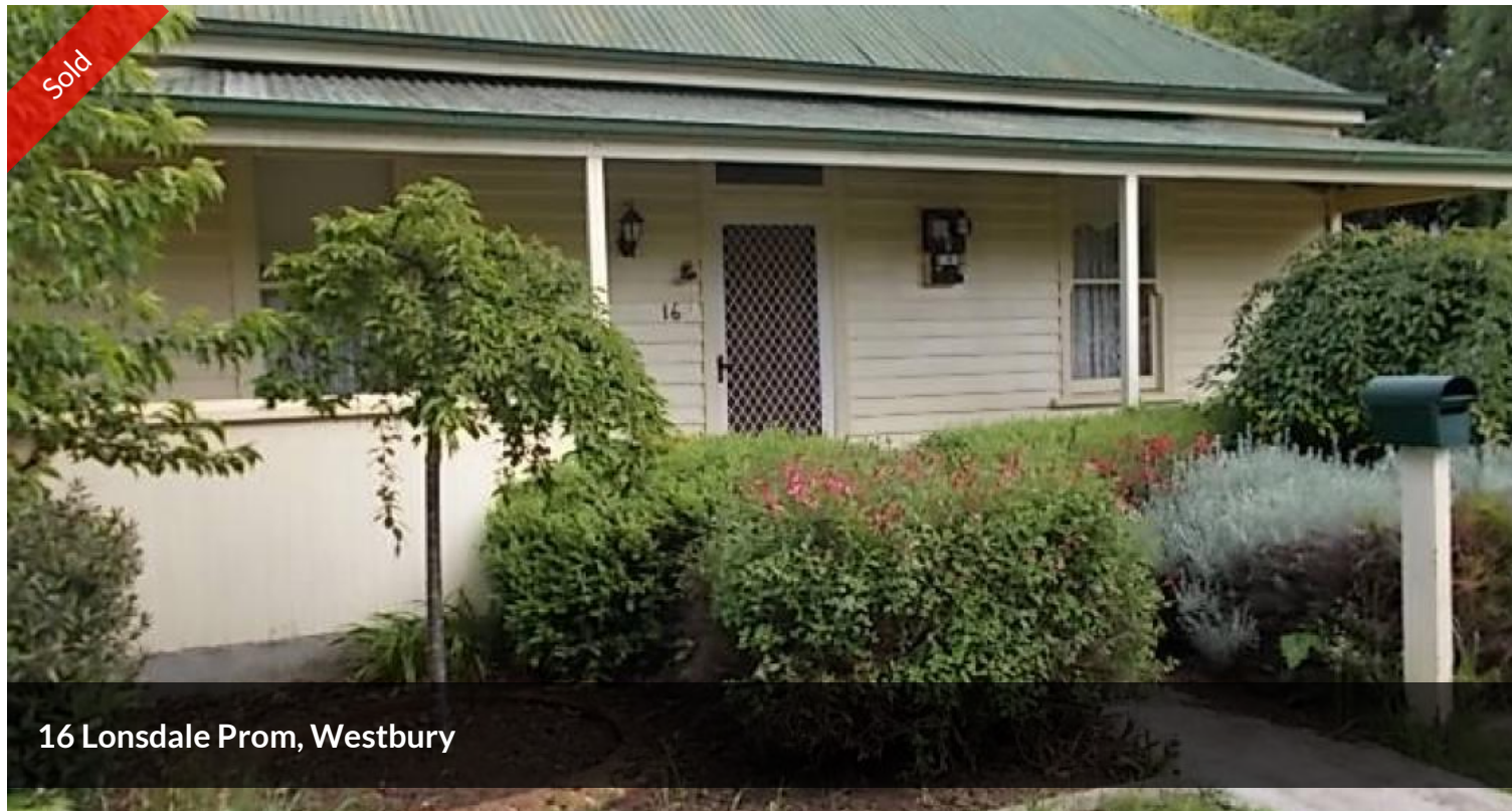
16 Lonsdale Prom, Westbury